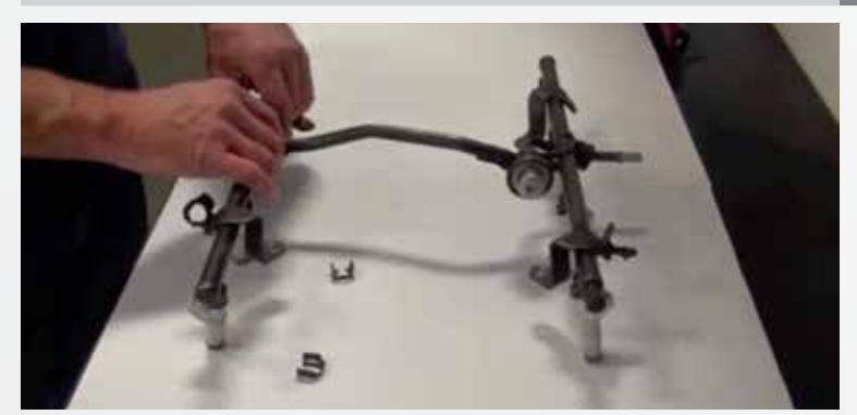
Remove the clips that retain the injectors in the rails.