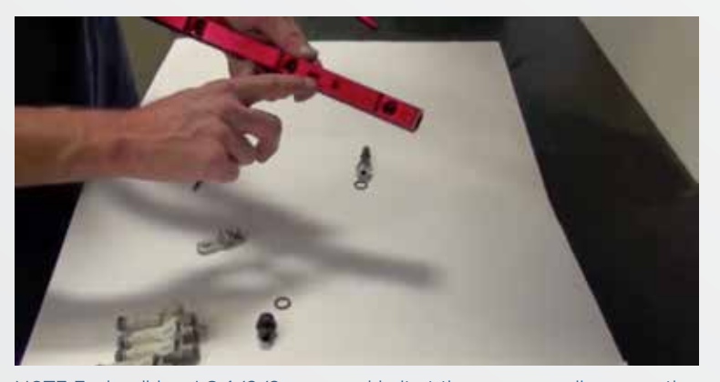
NOTE Each rail has LS-1/2/3 engraved in it at the corresponding mounting tab holes. Attach the mounting tabs at the proper location for your engine designation.

For both rails, install an end cap on the FRONT of the rail and a -6 rail end adapter on the REAR of each rail and attach the rail mounting tabs with the supplied 1/4"-20 bolts with a washer under each bolt head.