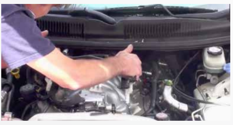
Remove the fuel rails and injectors by simply lifting them straight up.

NOTE Now is the time to inspect your fuel injector O-rings. If they are damaged, replace them. Damaged O-rings can cause a fuel leak.